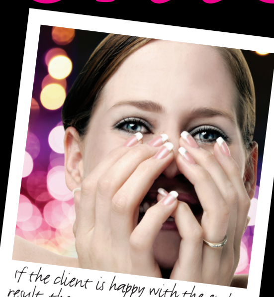
If the client is happy with the end result, they are much more likely to return in the future.