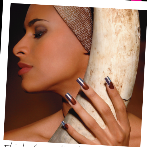
Think of your client's complete look when consulting on nail enhancements.

Liquid and powder takes time and skill to master, but it is one of the most popular nail services that can be used on finger or toe nails.