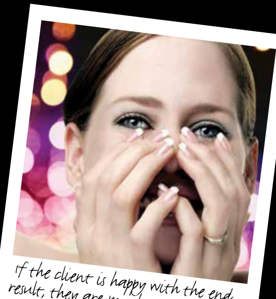
If the client is happy with the end result, they are much more likely to return in the future.