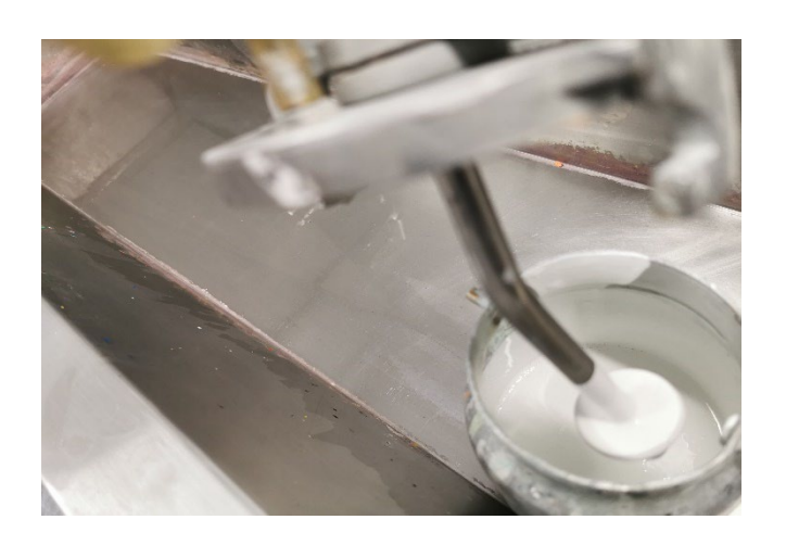
Photograph 34 – 36 showing wipe and clean of HVLP spray tool ready for storage Photograph 34

Photograph 34 shows adequate cleaning of HVLP spray tool