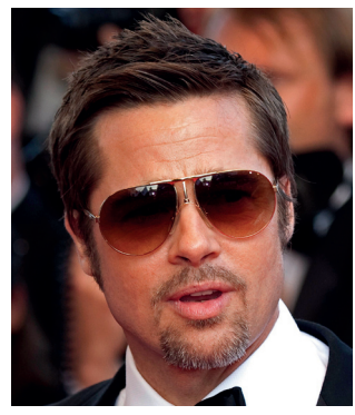
Goatee A narrow beard which arches the mouth and chin.