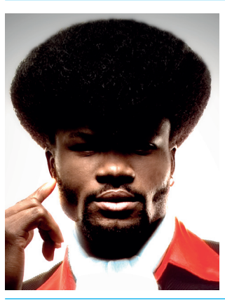
Unusual features Extra care will be needed when your client has dimples in the cheeks or chin. You can do this by stretching out the skin to pull out the fold. Other features to take care around are moles or the Adam's apple.

Sideburns are the areas of facial hair that grow down the sides of the face, in front of the ears. They can be worn alone or can connect the hair of the scalp with the rest of the facial hair.