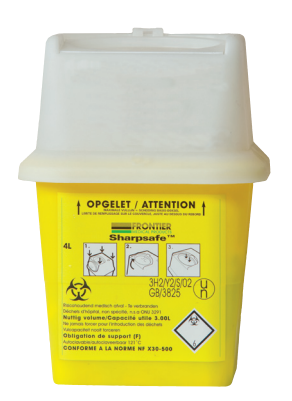
Sharps box The sharps box is where all used 'sharps' (ie blades) must be disposed of.

Also known as a mouthbrow, this is a thin, narrow, closely clipped moustache that outlines the upper lip.