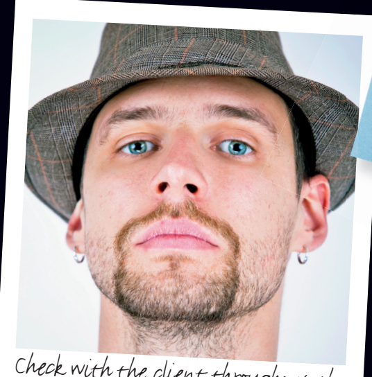
Check with the client throughout the service to see if they are happy with the shape you are creating.