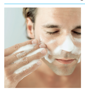
Exfoliate Exfoliation cleans the pores of the skin, reduces skin irritation, and makes shaving easier.