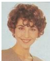
Image of style produced

Preparation methods used: I shampooed and conditioned her hair and towel dried it