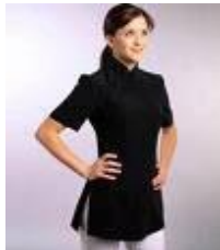
Image of stylist to show personal presentation/safe working practices

Advice to be given to maintain the Style: Put finishing spray and oil on corn rows