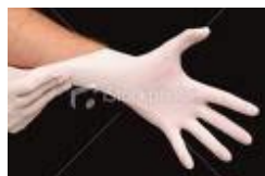
Image of stylist to show personal presentation/safe working practices