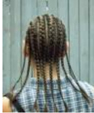
Image of style produced

Preparation methods used: I shampooed the hair because I find it easier to do corn rows on wet hair.