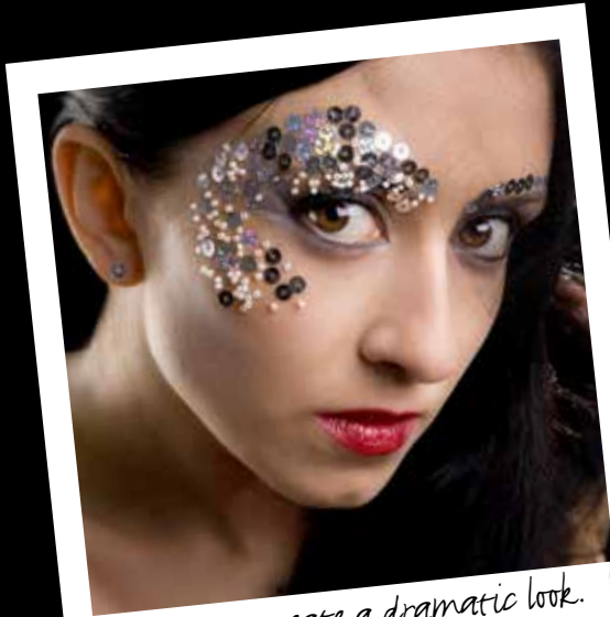
sequins can create a dramatic look.

Take time to evaluate the design and ask for feedback from as many people as possible in order to improve.