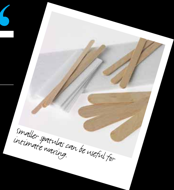
Smaller spatulas can be useful for intimate waxing.

This is an intimate treatment for your client so professionalism at all times is key.