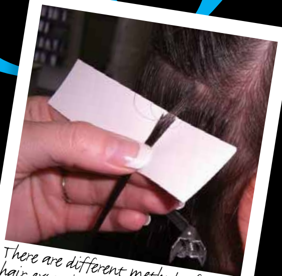
There are different methods of fixing hair extensions in.