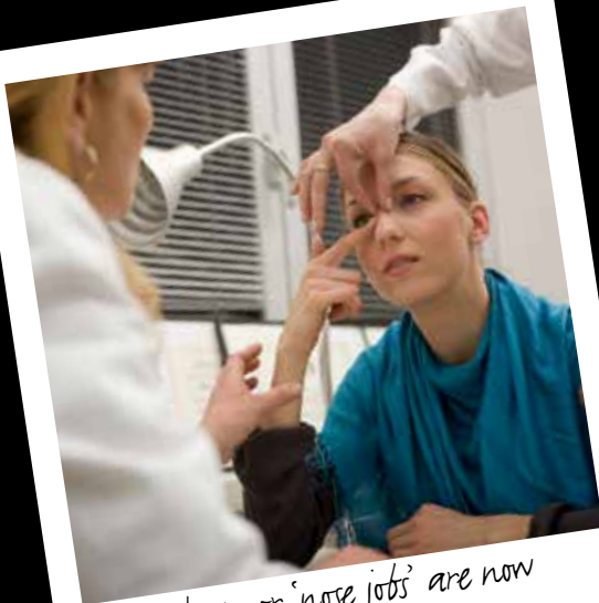
Rhinoplasty or 'nose jobs' are now commonplace.