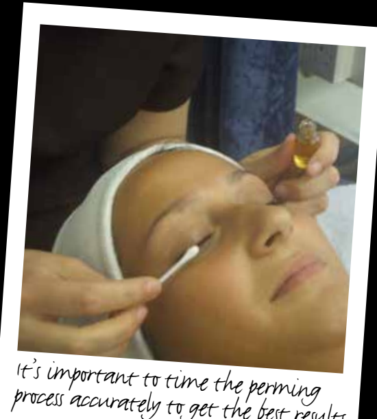
process accurately to get the best results.

Always remember to remove your client's contact lenses and eye make-up before you start an eyelash perm.