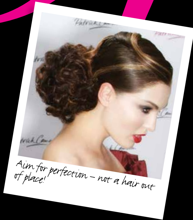
Aim for perfection - not a hair out of place!