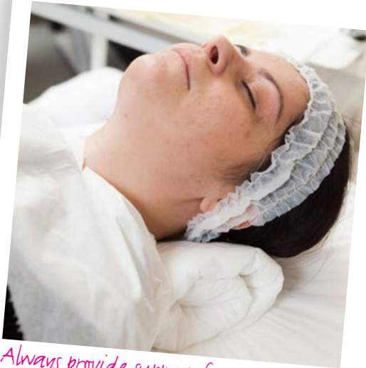
Always provide support for the neck area.