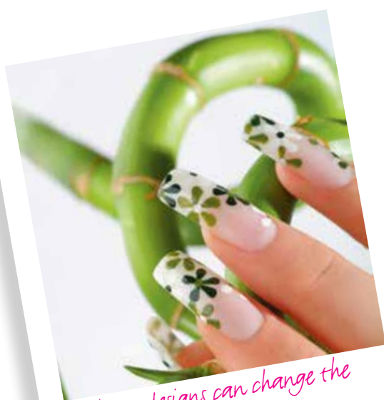
Nail art designs can change the overall look