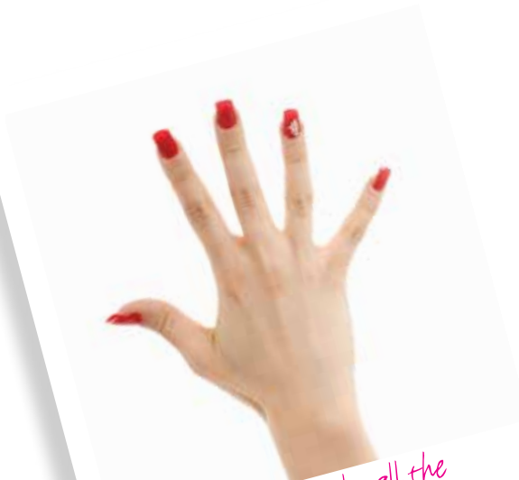
The correct tools make all the difference to the finished look.