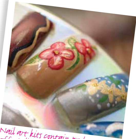
Nail art kits contain products at affordable prices for you to achieve many different looks.

To maintain the nail art design, recommend the client purchases a top coat. This should be applied every two days to provide a protective glaze to the nail art design.