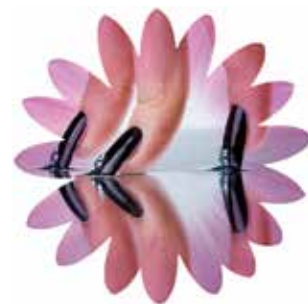
Nail art 9