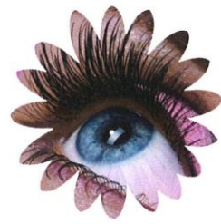
Eyebrows and eyelashes