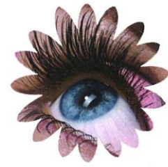
Eyebrows and eyelashes