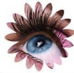
Eyebrows and eyelashes