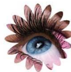
Eyebrows and eyelashes