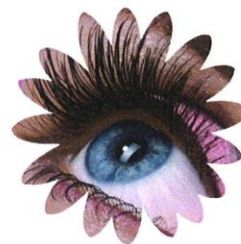
Eyebrows and eyelashes