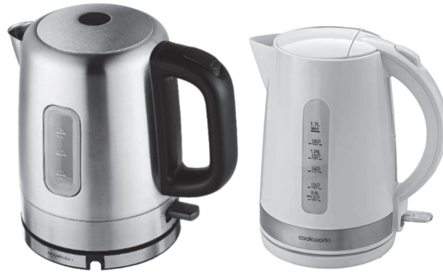
Electric Kettles – Published Anonymously – Amazon.co.uk

7 An engineer is designing the body of an electric kettle similar to those shown in Figure 1. It is intended that the final product will be manufactured in large quantities.