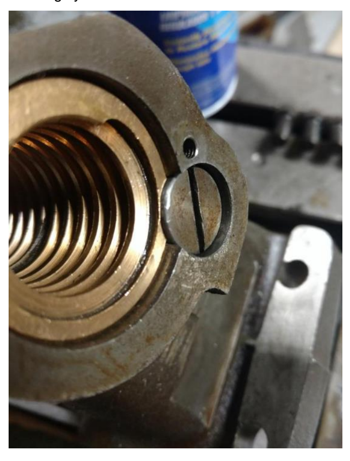
Photograph 8: final reassembly of feed control wheel, which has been cleaned down.

Photograph 7: Correctly refitted and tightened feed nut with no tooling marks and has been thoroughly cleaned.