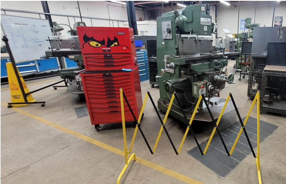
Photograph 1: Tools, equipment and all relevant technical documentation placed in their prepared working area within reach and methodical order of use. Appropriate barrier and safety signage in place.