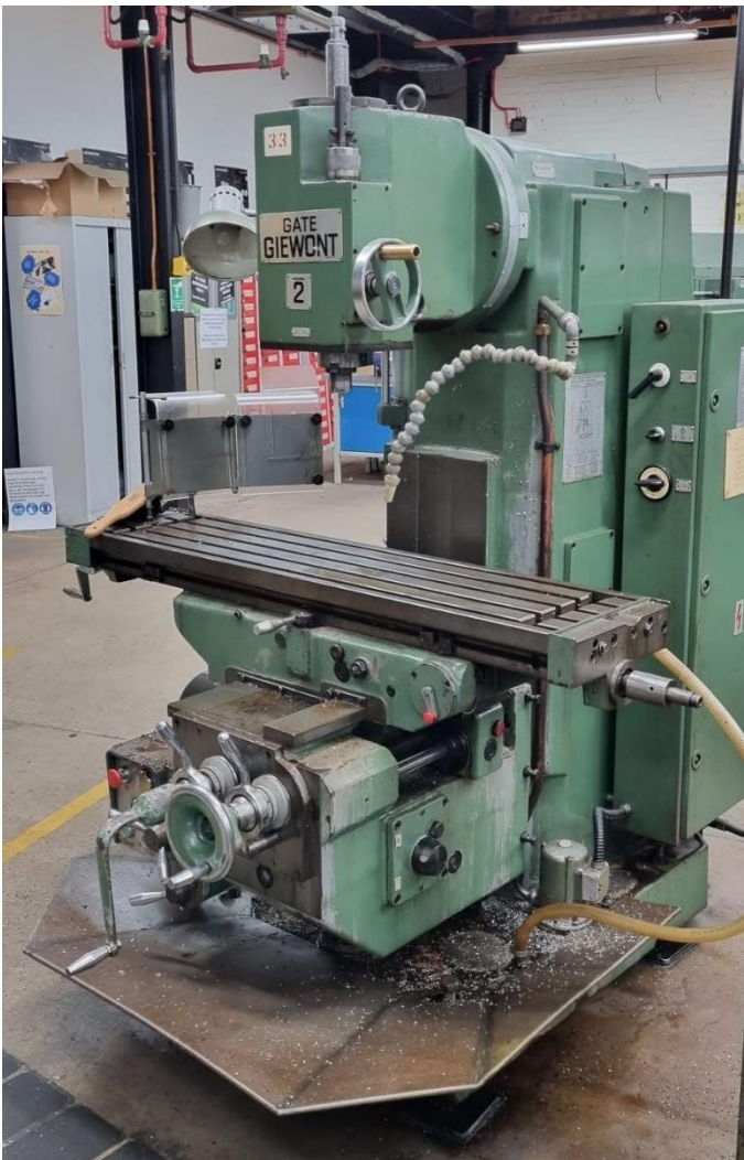
Photograph 2: Photographic evidence showing the condition of the full milling machine prior to any work being carried out. The candidate noted the debris and burr around the base of the machine from being previously used.