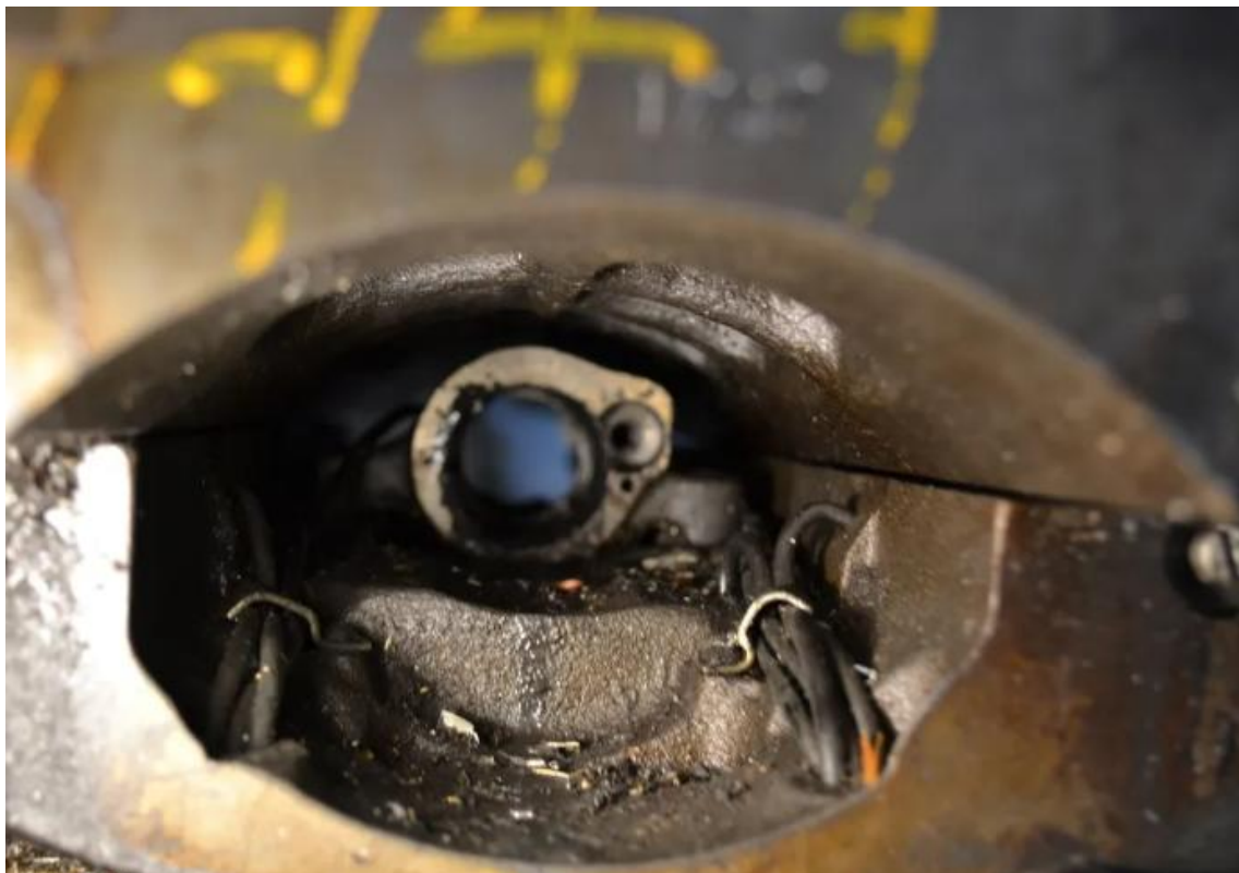
Photograph 6: Photographic evidence showing the wider working area after subassemblies removed from the milling machine, with parts, components and sub-assemblies placed in