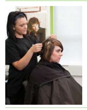
Client preparation Getting the hair ready and putting a gown on the client.

Ornamentation that is used to enhance the finished look, such as flowers or jewels.