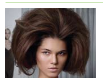
Backcombing A dressing out technique with a comb, for giving root lift and/or volume to the hair.

Information given to the client on style and hair maintenance.