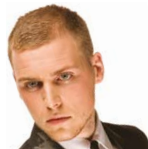
Assist with shaving