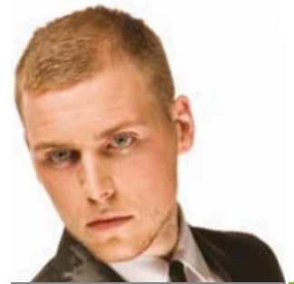
Assist with shaving

Working up a thick lather is essential to the client's comfort.