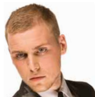
Assist with shaving