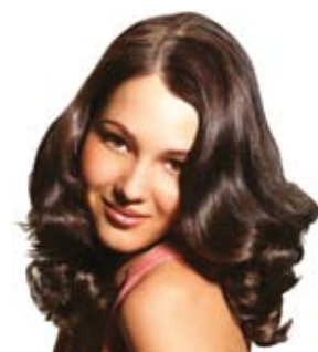
Assist with perming