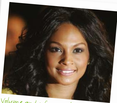
Volume and soft waves help to give Alesha Dixon this stunning, feminine look.