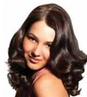
Assist with perming