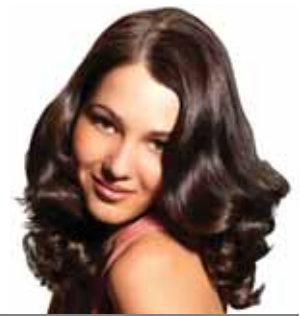
Assist with perming