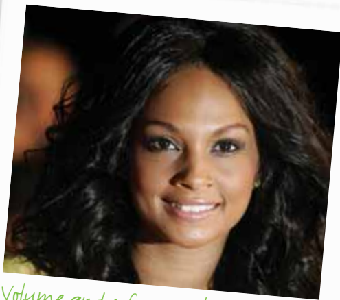
Volume and soft waves help to give Alesha Dixon this stunning, feminine look.