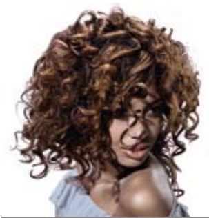
Remove hair extensions