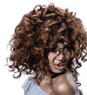
Remove hair extensions

Recommend aftercare products to your clients to keep their added hair shiny and sleek.