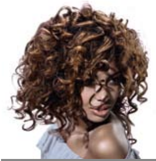
Remove hair extensions