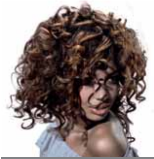
Remove hair extensions