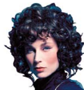
Perming & neutralising