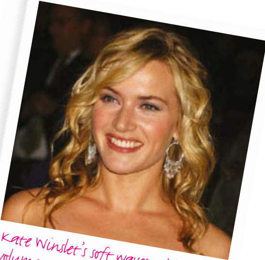
Kate Winslet's soft waves add volume and glamour to her look.