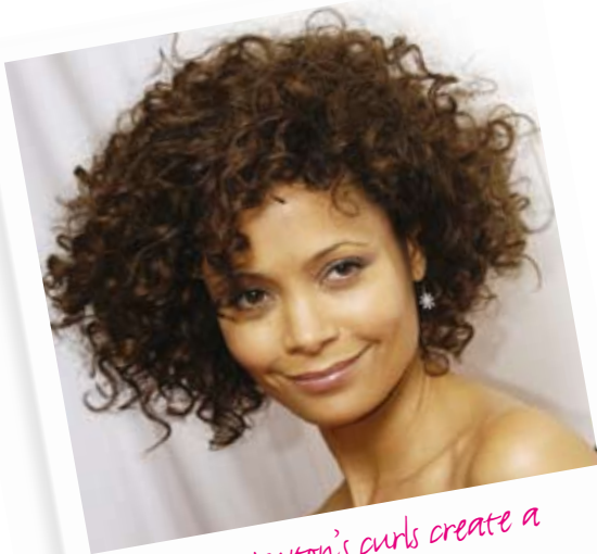
Thandie Newton's curls create a flattering shape.

“ Perming is a necessity for some customers, and a technique that shouldn't be feared.