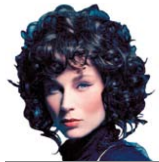
Perming & neutralising