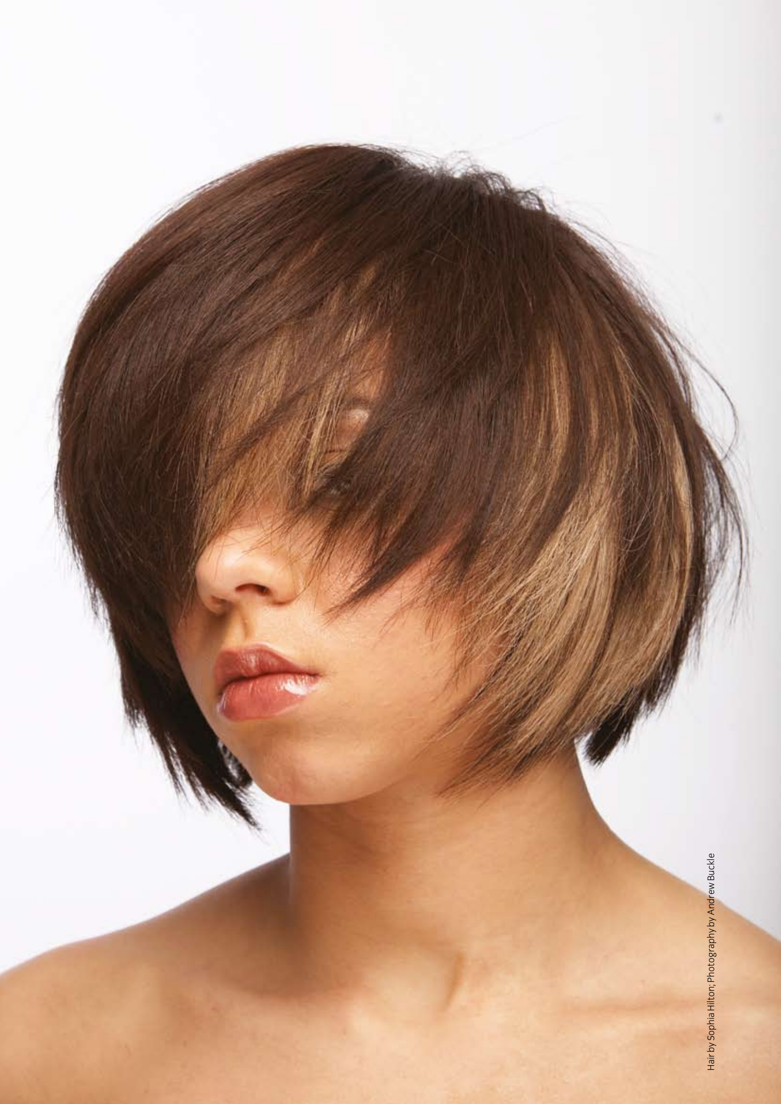
Hair by Sophia Hilton