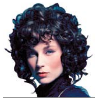
Perming & neutralising