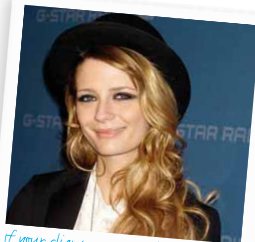
If your client wants a voluminous look like Mischa Barton's, extensions can help to achieve this.

This will be completed through written and oral questioning by your assessor. For details of what you must know, see pages 16–22.