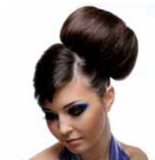
Hair and scalp treatments

Your assessor may use this space for any additional comments they may have about your work.