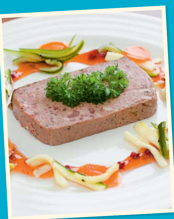
Pâte can be made from the liver of pigs, ducks, chickens or geese. It can be served in a crust (en croûte) or moulded as a terrine.