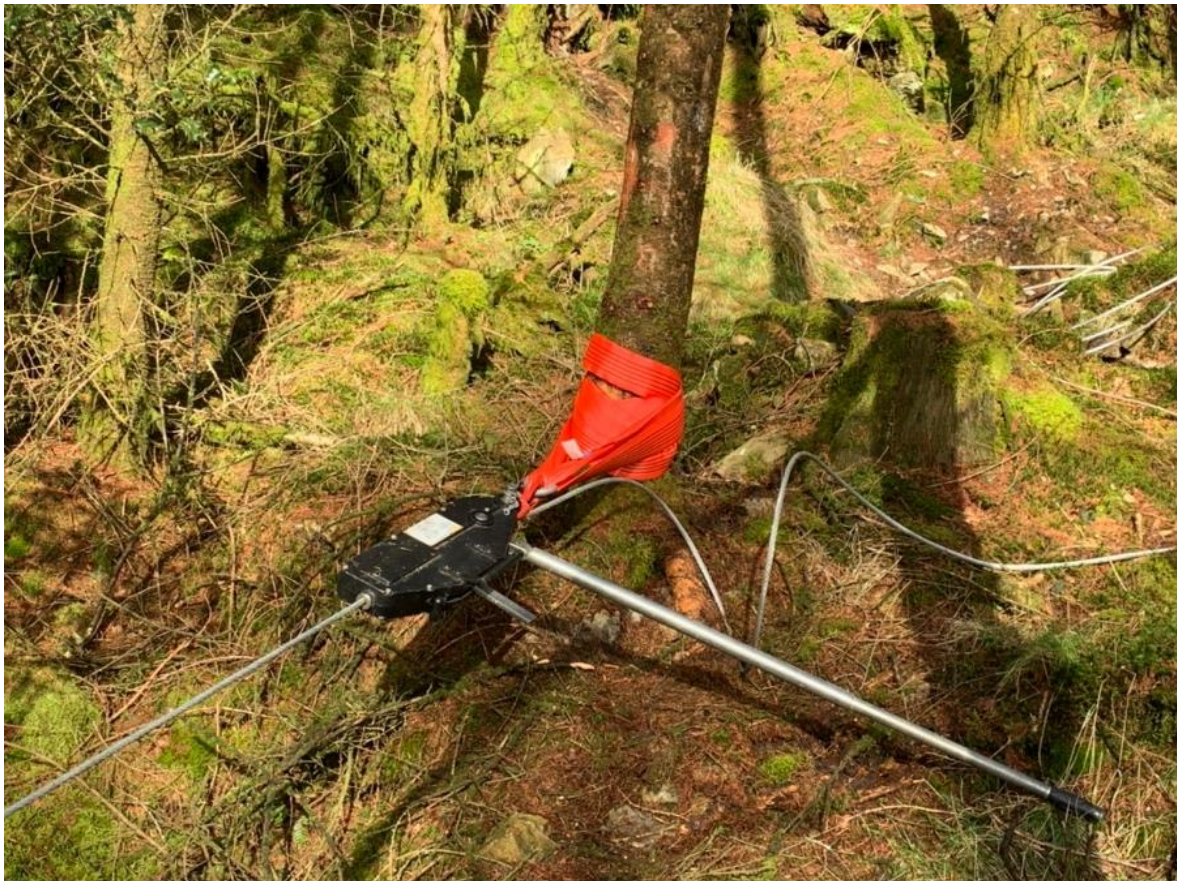
Above & below: winch connected to sling using shackle.