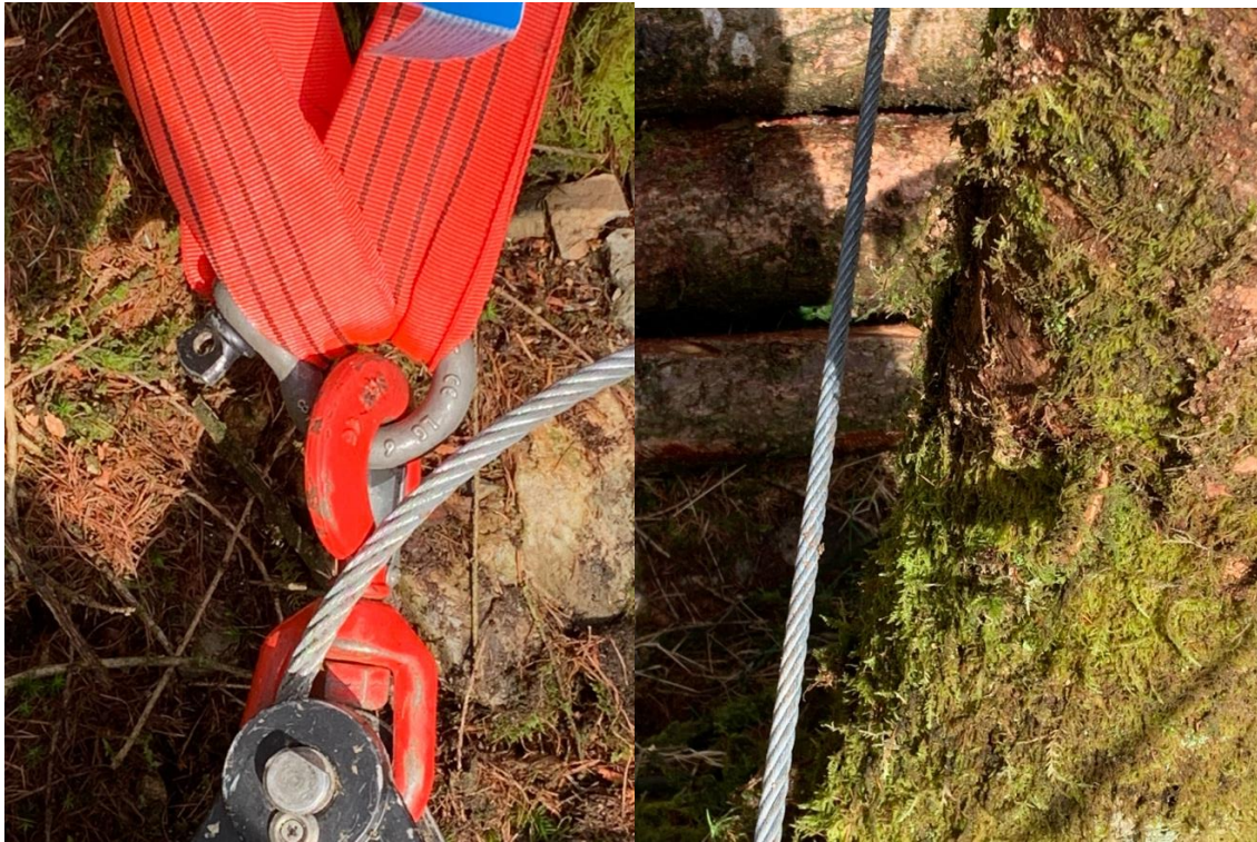
Above right: cable route free of obstructions.