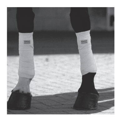
https://www.tudorroseequine.co.uk Figure 3