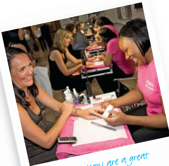
Nail competitions are a great way to build confidence.