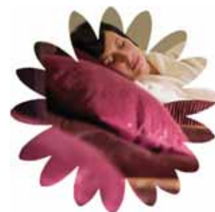
Sauna, steam, hydrotherapy