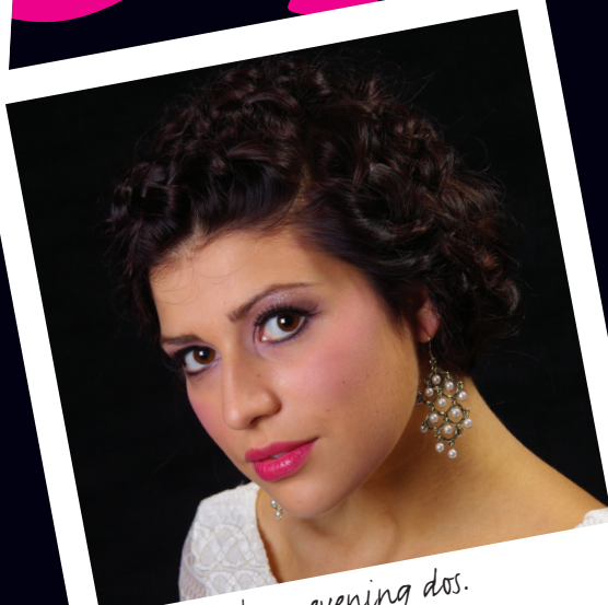
... or for classy evening dos.